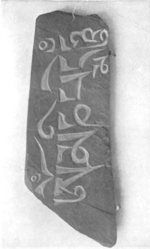
MANI STONE WITH INSCRIBED PRAYER.