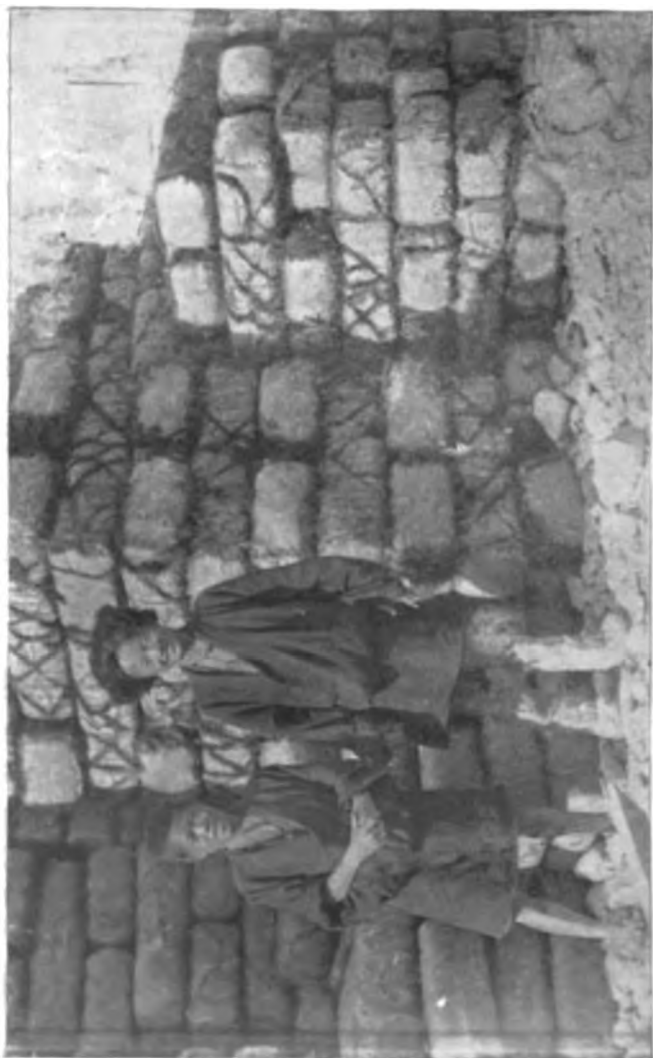
A WALL OF TEA BALES.