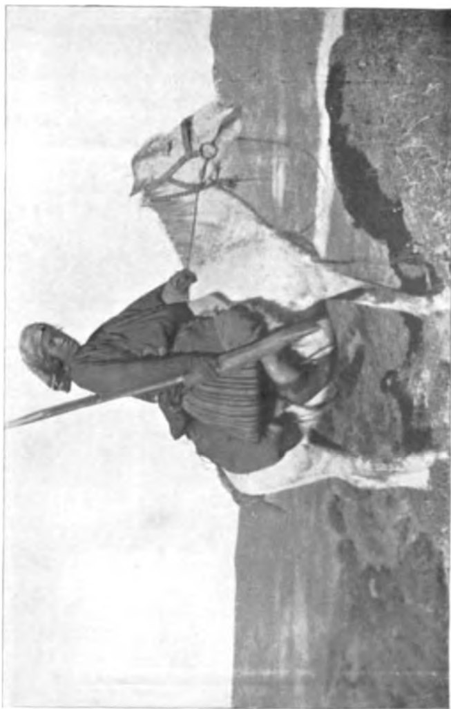
A TIBETAN TRAVELER.