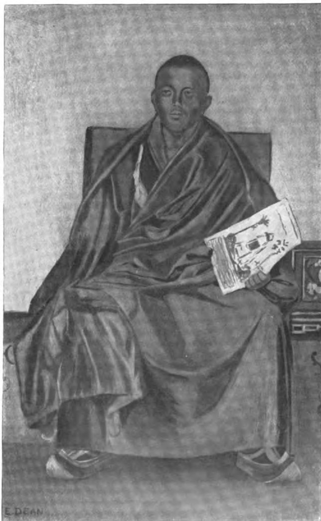
MINA FUYEH. SOMETIME ABBOT OF THE LAMOSEKY OF KUMBUM.