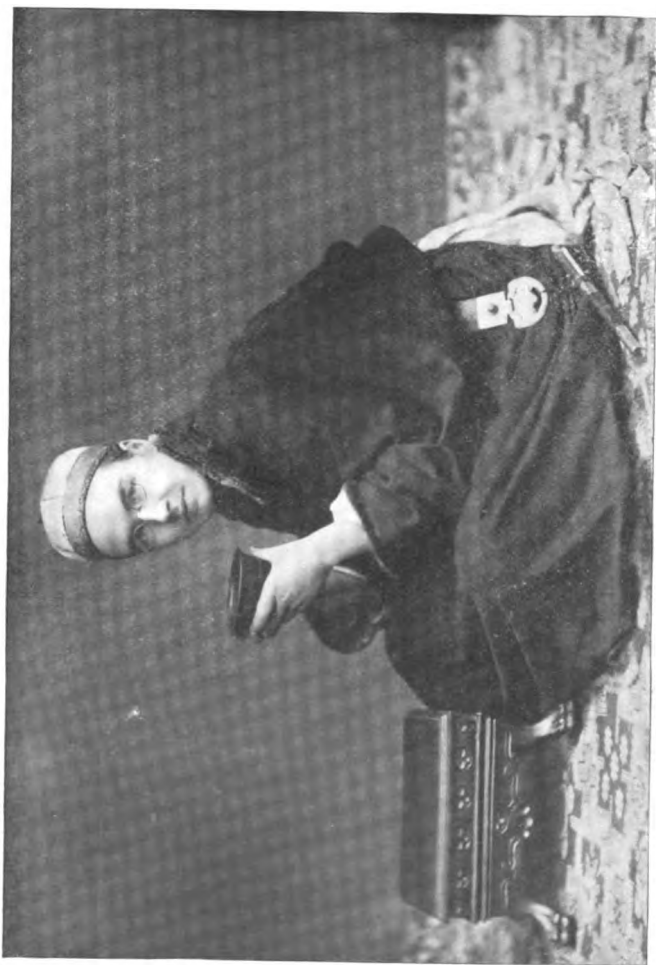
THE AUTHOR IN TIBETAN COSTUME.