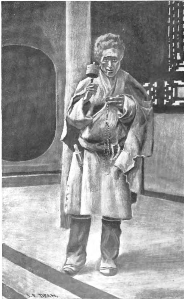
TIBETAN BUDDHIST LAYMAN, WITH PRAYER-WHEEL IN HAND.