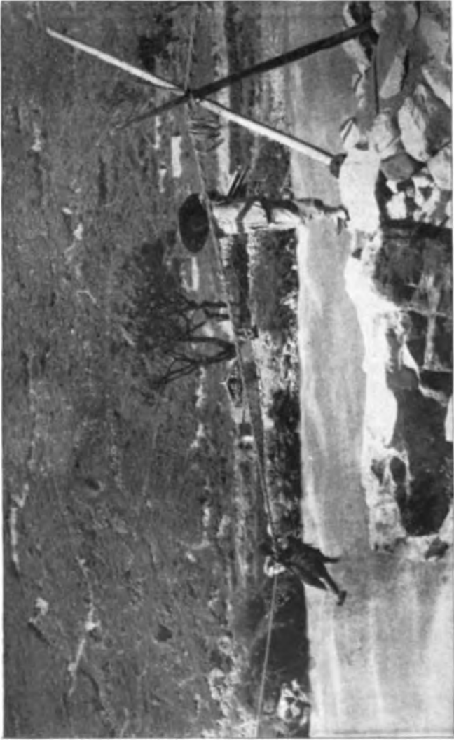
CROSSING A ROPE BRIDGE.